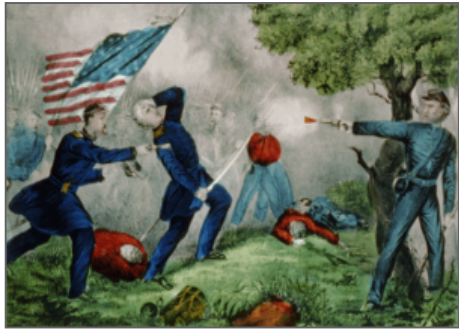
At left, the Currier & Ives color lithograph depicts the "Death of Col. Edward D. Baker at the Battle of Ball's Bluff, Oct. 21, 1861. During the Civil War, the American printing company produced many lithographs of battle scenes.

A small Union raiding party on a limited reconnaissance mission encountered and engaged a few Confederate pickets. From this unintended skirmish, a battle evolved. Of the approximately 3,440 troops involved, 223 Union troops were killed, 226 wounded and 553 captured. The Confederates lost 36 men; 110 were wounded and three captured.